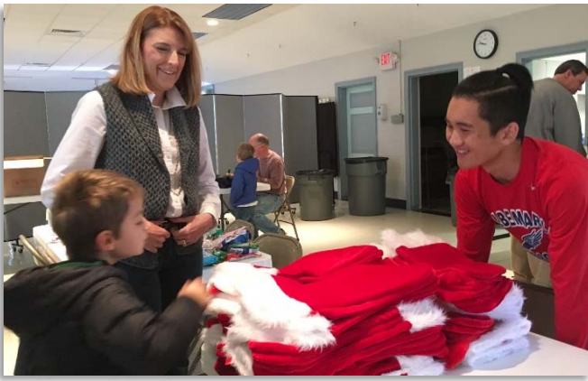
Stuffing stockings for our PACEM guests