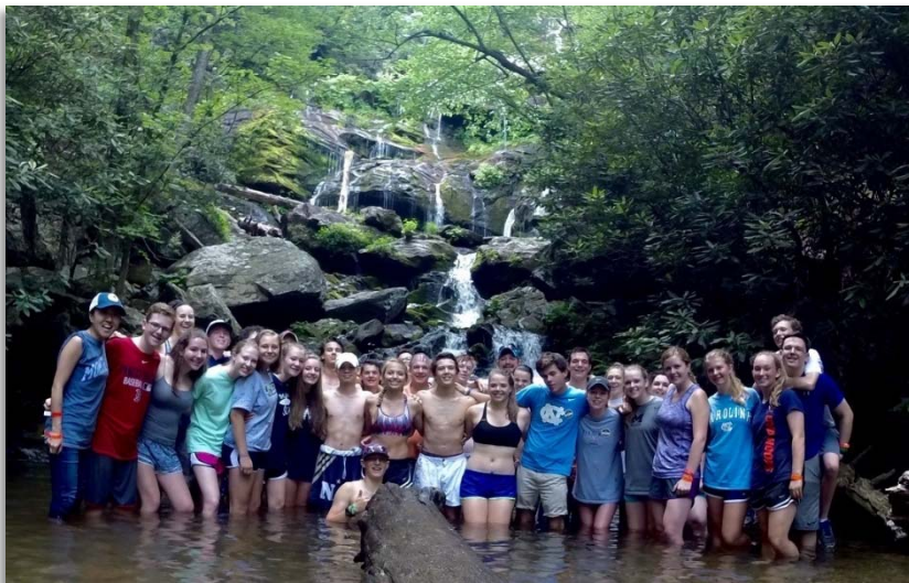
This summer over 30 First Pres youth attended Montreat Youth Conference to gain a deeper understanding of God and what it means to connect with one another and with neighbors.

Congregation members stepped up in so many roles! Gardeners for the Memorial Garden, photographers for baptisms, chancel team members, attendance recorders, front office volunteers, helpers for special children's programs, Sunday morning teachers, flower deliverers...the list goes on, and the proof of our congregation's love for and devotion to First Pres, to one another, and to God is evident.