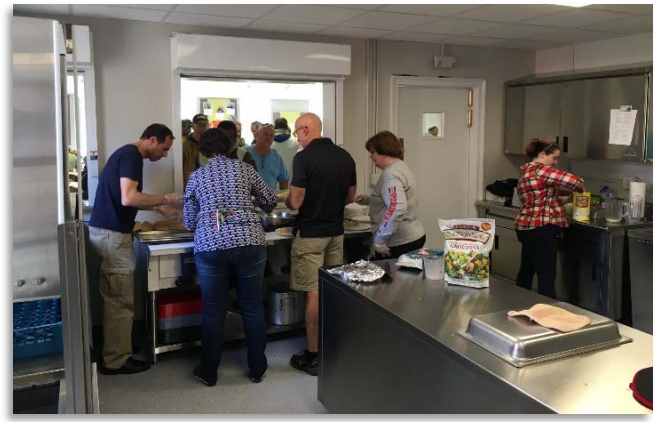
Putting the renovated kitchen to use at Wednesday Soup Kitchen

This year the Quilt Sowers were recognized in The Spotlight , an electronic newsletter from the Presbyterian Women of the James, for their $4,500 donation from quilt sales to the Shelter for Help in Emergency, a local organization whose goal is to end domestic violence in our community. Combined together, the First Pres outreach is staggering.