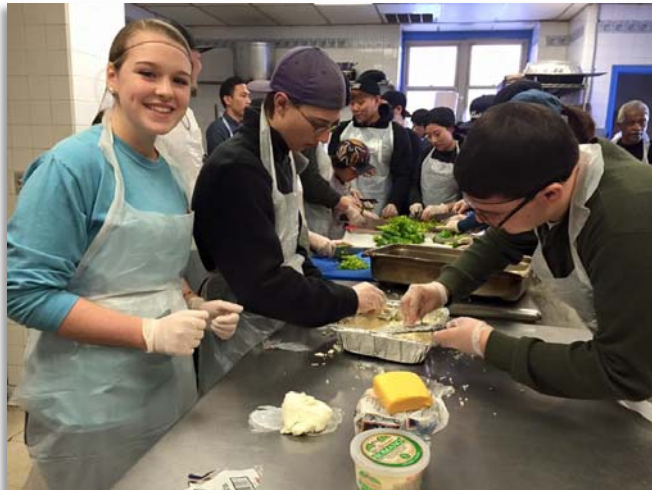
Youth help out at a Washington, D.C. soup kitchen

This year's guest speakers help to highlight our effort to do justice beyond our own community. POJ missionary,